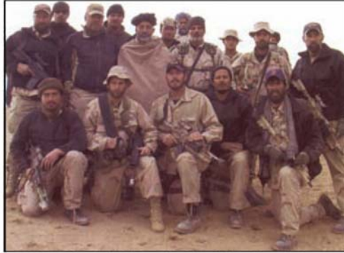
Hamid Karzai (middle row, third from left) and Special Forces.