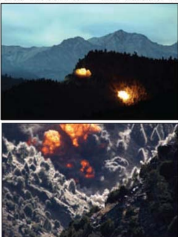
Air Strikes in the Tora Bora Mountains.

As the evaders attempted to clear the danger areas, the men of the SOTF tried to locate any Afghan OP with eyes on the AQ front line and UBL specifically. No such position existed. The Afghan guides who accompanied the SOTF personnel grew extremely nervous as the party approached known AQ positions and refused to go farther. Faced with the improbable circumstance of Ali's return, much less pinpointing UBL's position at night, the quick reaction force (QRF) turned its attention to recovering the evaders. After moving several kilometers under cover of darkness, attempting to ascertain friend from foe, and negotiating through "friendly" checkpoints without requisite dollars for the required levy to pass, the evaders finally linked up with their parent element. All returned to base to reassess the situation and plan for subsequent insertion the following day.