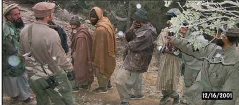
An SF Soldier assists Eastern Alliance Soldiers in supervising al Qaeda Prisoners.

occupying terrain from the combined effort, save nominal Afghan security details.