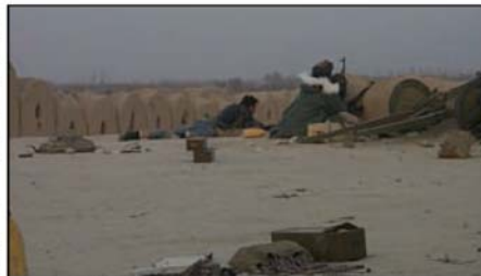
U.S. SOF and NA on the northwest parapet of the Qala-i Jangi Fortress.