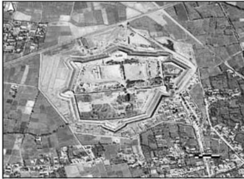
An Aerial View of Qala-i Jangi.

to 29 November, and U.S. SOF assisted the NA forces in quelling this revolt. The ad hoc reaction force—consisting of American and British troops, Defense Intelligence Agency (DIA) linguists, and local interpreters—established overwatch positions, set up radio communications, and had a maneuver element search for the trapped CIA agent. The agent escaped on the 25th. The next day, as the SOF reaction force called in air strikes, one bomb landed on a parapet and injured five Americans, four British, and killed several Afghan troops. The pilots had inadvertently entered friendly coordinates